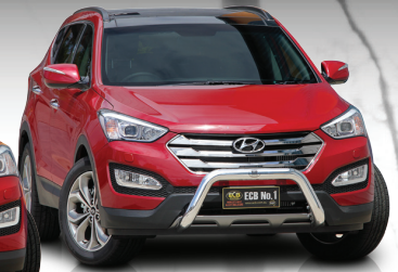
76mm Nudge Bar

The full range of frontal protection for the Hyundai Santa Fe (09/2012on). See reverse side to view nudge bar information.