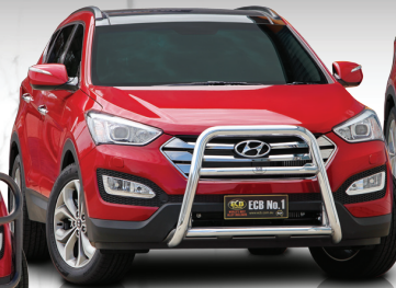
63mm Series 2 Nudge Bar