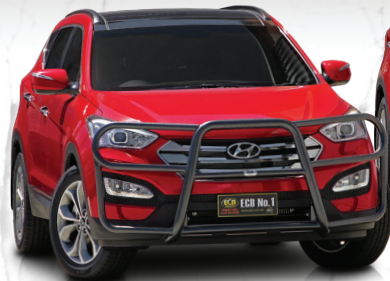
Type 8 Bar